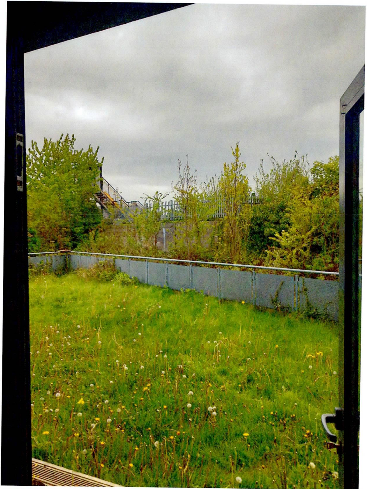
View onto bridge to be changed from sun decking/garden area No.66 Sevenoaks